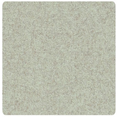
ICE MENTHA 118937