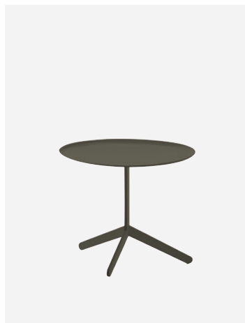
Cod. PI10 Metal, RAL 6006 Grey Olive