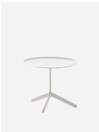
Cod. PI10 Metal, RAL 9002 White