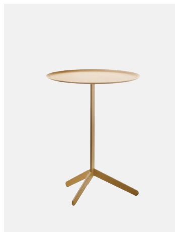
Cod. PI20 Metal, RAL 1005 Honey Yellow