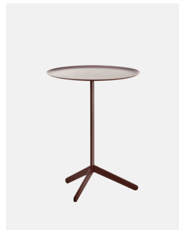
Cod. PI20 Metal, RAL 3007 Black Red