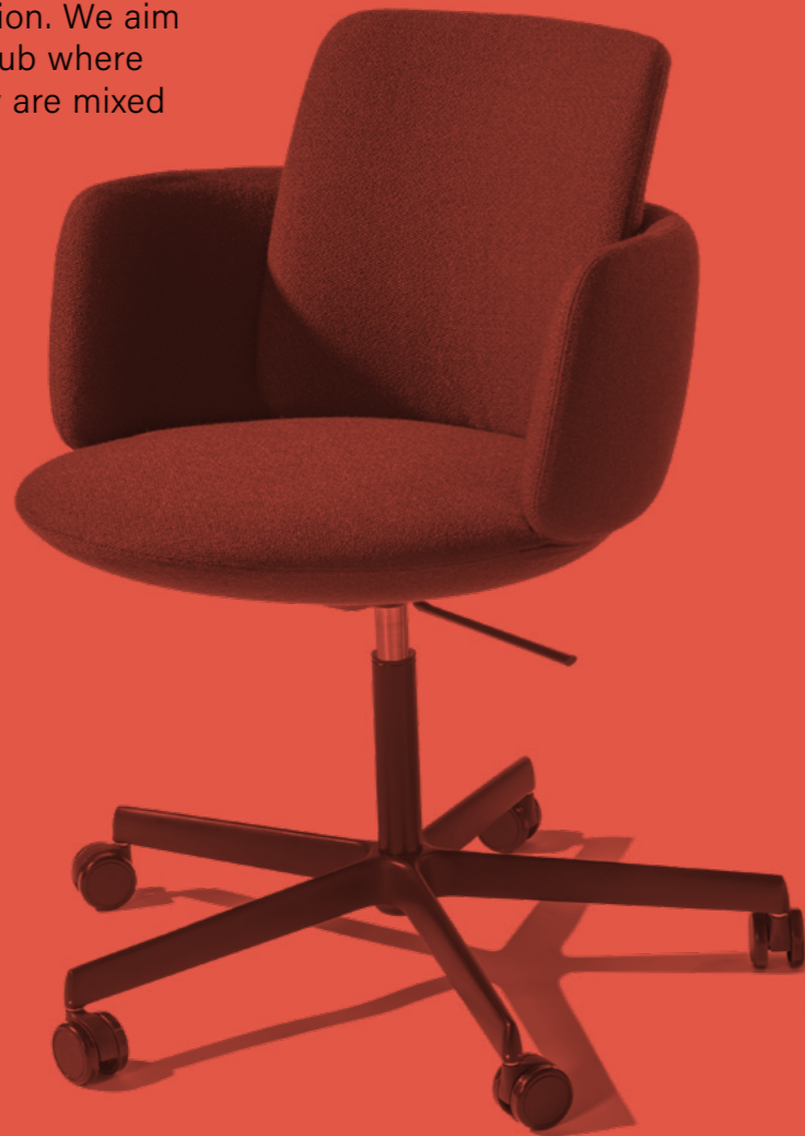
↗ Cuscini Work

Every visionary architectural project stems from essential design research: for us, it starts by building solid foundations to support the poetry of design. Our goal is to revitalize a brand with a rich product history. We are excited about this journey, starting with the new products you'll see here, our enlarged staff, and our new headquarters, which since January '24 has hosted all our resources and will hopefully shape our vision. We aim to create an inclusive hub where creativity and humanity are mixed to create products, relationships, and projects, defining the future poetry of maxdesign.