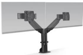
Dual arm features sliders for maximum adjustability

8540-TM-CK: Thru-Desk Conversion Kit, E2-2