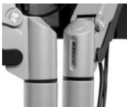
Dual arm features tension indicator for easy installation