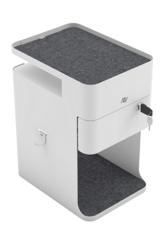
Overall Dimensions 256 W x 350 D x 445 H mm