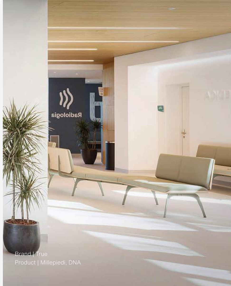
Brand | True Product | Millepiedi, DNA