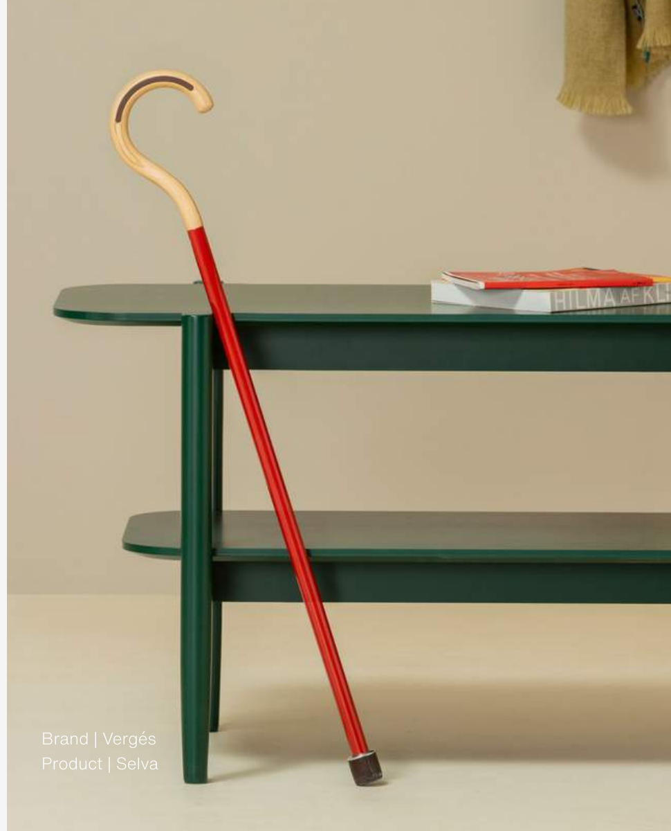
Brand | Vergés Product | Selva