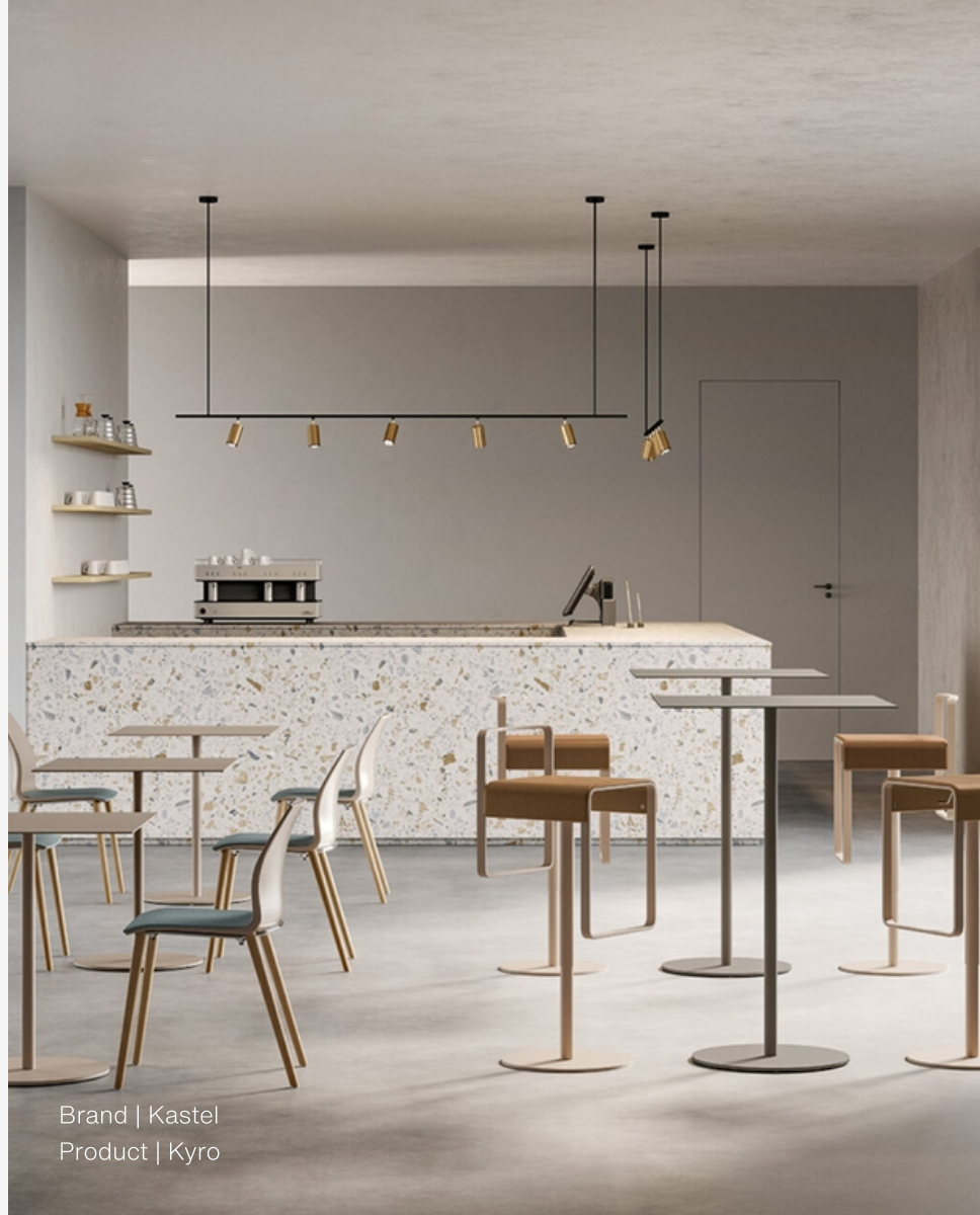
Brand | Kastel Product | Kyro