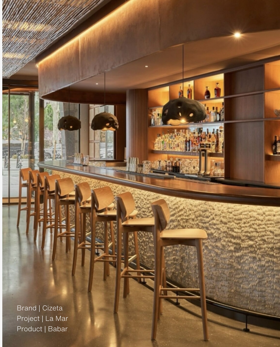
Brand | Cizeta Project | La Mar Product | Babar