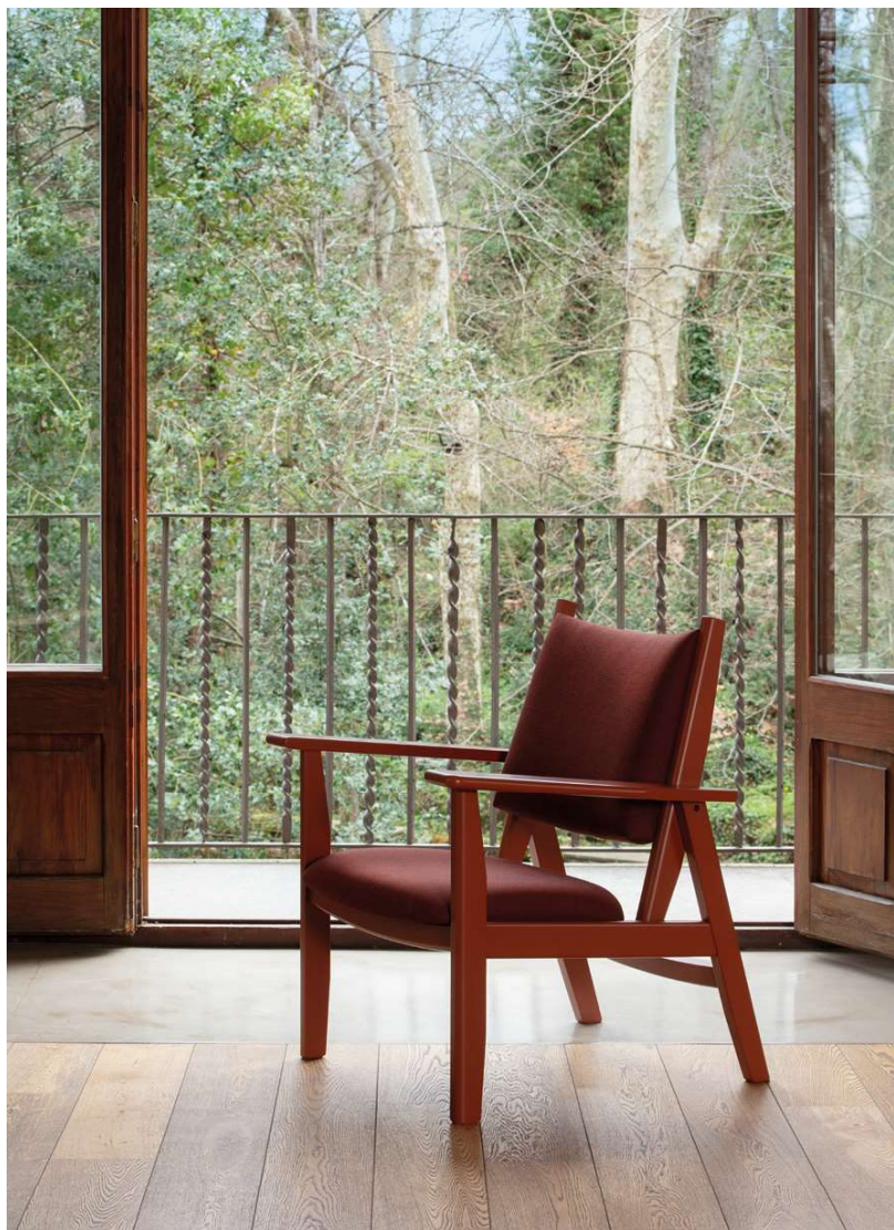
Albufera armchair / Structure and backrest: lacquered beech wood Clay 8004 EM Seat and backrest: upholstered Gabriel Swing 52005 Selva rectangular table / Structure: dyed beech wood Grey 79 EM Top: natural varnished beech wood EM