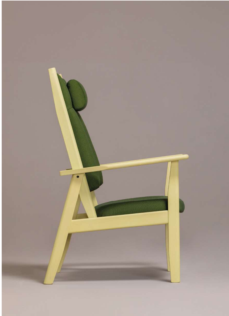
Albufera armchair with headrest / Structure and backrest: solid beech wood dyed Salvia 10 EM Seat and backrest: upholstered Gabriel Swing 53218