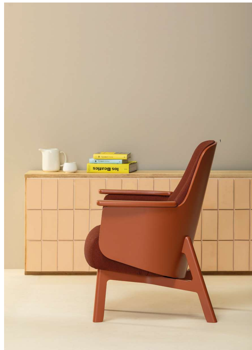
1. Bahia armchair / Structure and backrest: lacquered beech wood Clay 8004 EM Seat and backrest: upholstered Gabriel Swing 52005 2. Bahia armchair / Structure and backrest: beech wood dyed Sand 26 EM Seat and backrest: upholstered Gabriel Crisp 4721