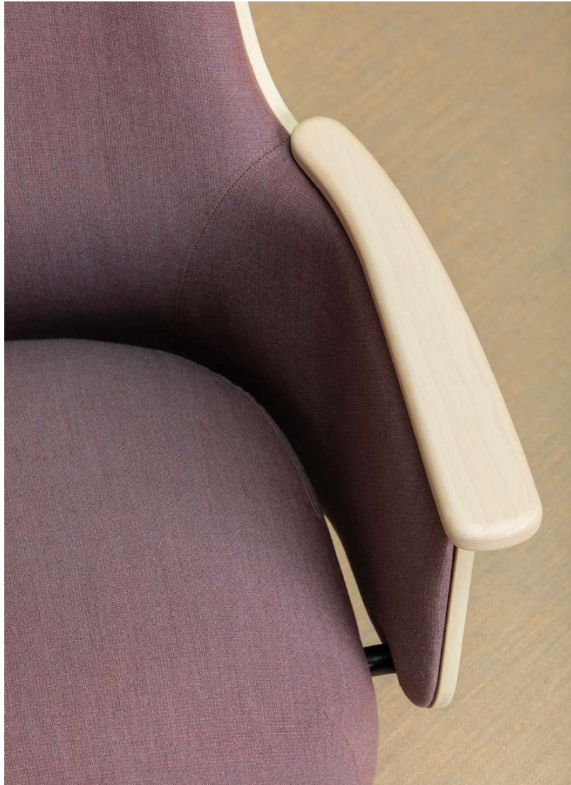
Detail of the sanitary gap of the Bahía armchair.