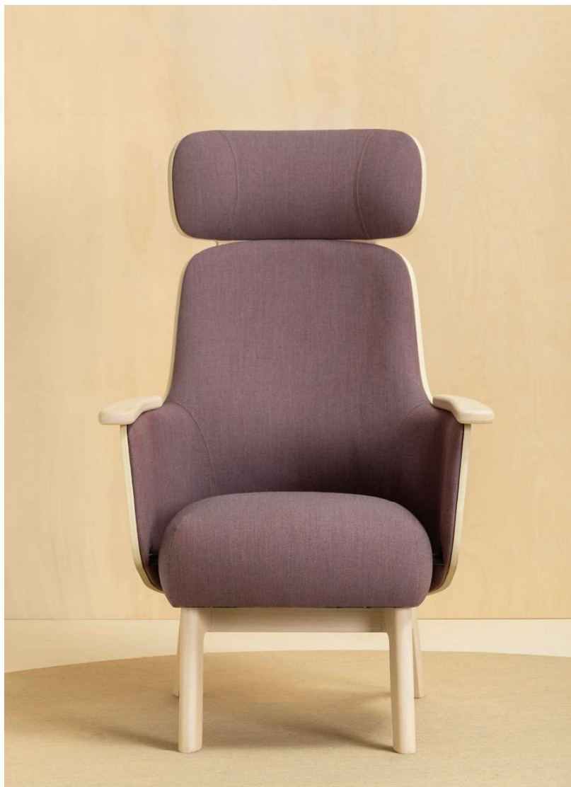
Bahia armchair with headrest / Structure and backrest: beech wood dyed Sand 26 EM Seat and backrest: upholstered Gabriel Crisp 4702